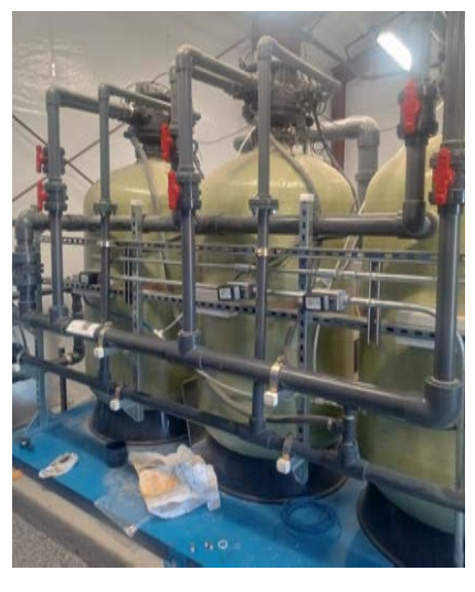
New filtration equipment installed at the Big Valley Rancheria drinking water treatment plant.

EPA awarded $1.58 million to the Big Valley Rancheria through its Drinking Water Tribal Set-Aside (DWTSA) and Water Infrastructure Improvements for the Nation (WIIN) Act, Lead Reduction funding programs to support the planning, design, and construction of the new treatment plant. Additional project funding included $4.81 million from USDA, $550,000 from Bureau