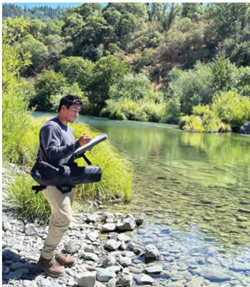
Water quality sampling at the Sherwood Valley Band of Pomo Indians Reservation

Starting on April 5, 2022 , the Section 106 Program received a Class Exception that waives the tribal program match requirement for new grants and supplemental awards made thereafter.