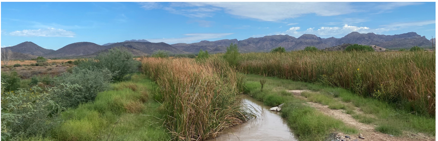
Gila River Indian Community

Download Guidance: epa.gov/water-pollution-control-section-106-grants/clean-water-act-section-106-tribal-guidance