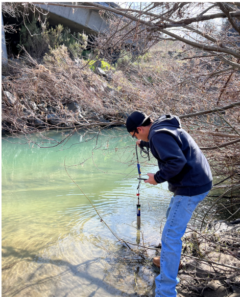
Water quality sampling at the Coyote Valley Band of Pomo Indians Reservation

Starting on April 5, 2022 , the Section 106 Program received a Class Exception that waives the tribal program match requirement for new grants and supplemental awards made thereafter.