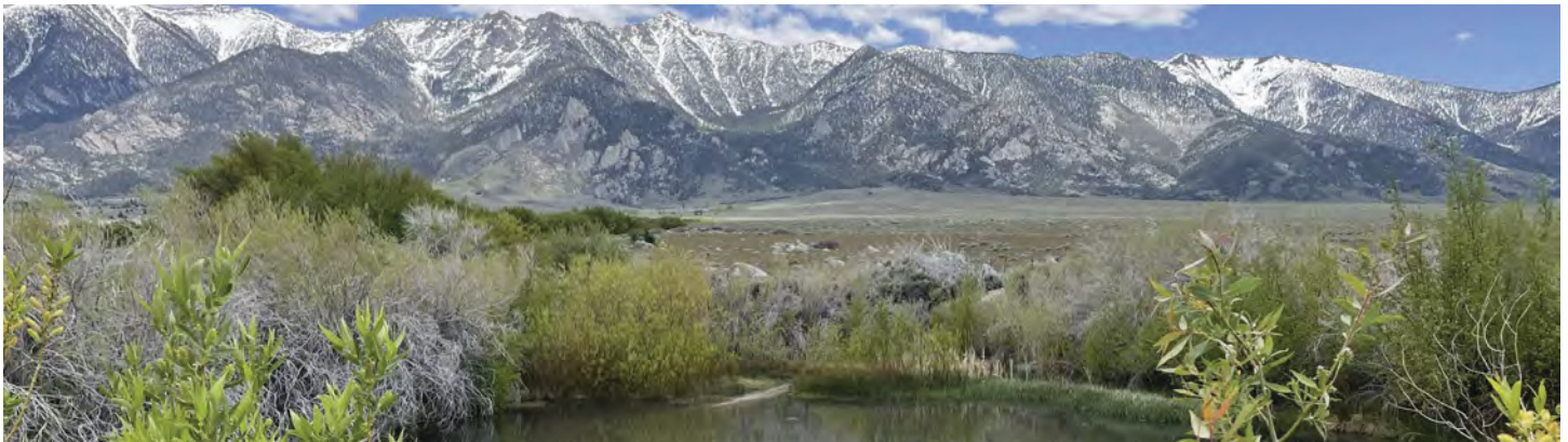
Confederated Tribes of the Goshute Reservation

Download Guidance: epa.gov/water-pollution-control-section-106-grants/clean-water-act-section-106-tribal-guidance