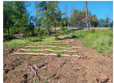
The Middletown Rancheria is using EPA funding to install straw waddles to help minimize erosion and to reduce sediment levels in stormwater runoff entering the Saint Helena Creek.