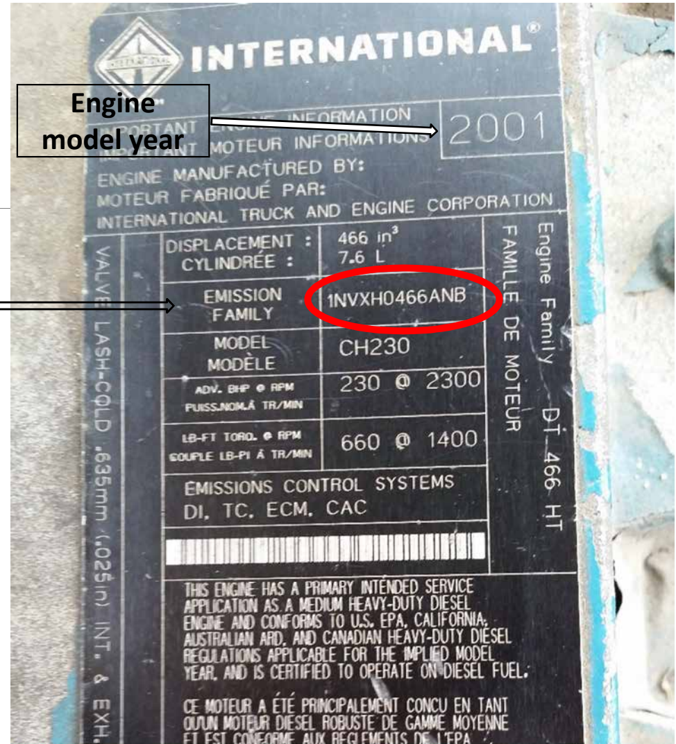
Photo #3: Engine tag with engine serial number and EPA engine family name