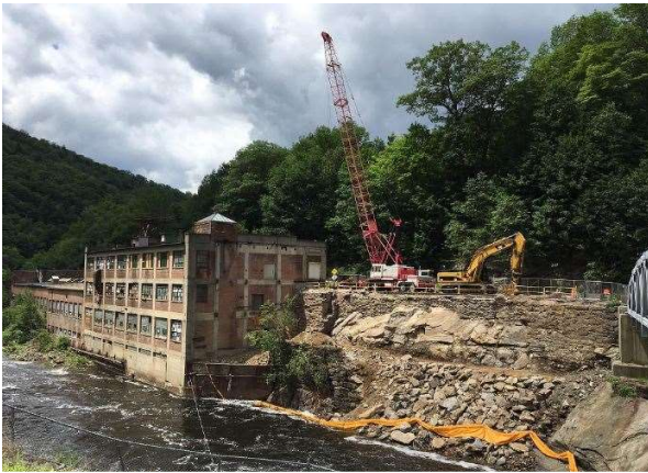
Cleanup in progress, along edge of river

“With a population of about 120 people, the Town of Monroe is truly a rural small town. Taking on a project of this size and complexity cannot be done without partners. We are thankful for our regional partner, the Franklin Regional Council of Governments; our state partner, the Massachusetts Executive Office of Energy and Environmental Affairs; and our federal partner, US Environmental Protection Agency Region 1. This project was decades in the making, and there is still more to be done, but the mitigation of hazardous conditions and the creation of a wonderful overlook park will allow the Deerfield River to be protected and enjoyed for generations to come.”