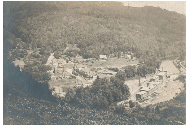
View of Monroe, pre-1900s

Because of the condition of the wood portion of the mill, the town condemned the property in 2015. Property taxes had not been paid since 1999 and the owner was unresponsive. In April 2016, a court order gave the town permission to enter the building and assess the situation. Using EPA grant funds, the Franklin Regional Council of Governments conducted an assessment of the wood structure in May 2016 and found hazardous contamination. The site contained materials with asbestos as well as other hazardous materials, including florescent light tubes, light ballasts, tires, containers of oils and lead paint. In July 2016, the town ordered a demolition of the wood structure. The town voted to take the wood structure portion of the property by eminent domain and the local Select Board began securing funds and permission to do a cleanup, which included getting permission from the Massachusetts Historic Commission. In late 2016, the town voted to keep the site as a park in perpetuity.