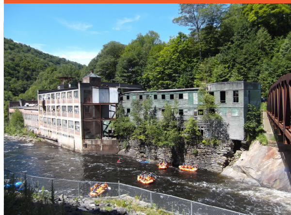
Ramage Paper Mill site, before cleanup