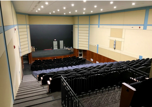
New 333-seat auditorium in the Park Theater included a 27-foot wide screen and 17-speaker surround sound system

“The new Park Theatre will be a unique venue. It’s one of the only built-from-the-ground-up, small community-based performing arts centers to be opened in our region in over 50 years. It will be a magical place for local & regional communities, the State of New Hampshire and New England.”