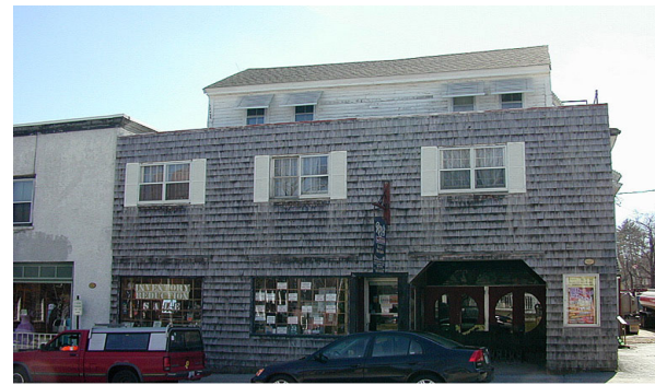
The old theatre, above, was torn down in 2013 and replaced with a new building in 2020, below.

Raising the more than $6 million dollars necessary to buy and build the new theatre was one of the biggest challenges to development. Sustained support was the key to pulling together a project of this magnitude. Funding came from federal grants (including a $2 million loan from USDA Rural Development), as well as donations from 75 businesses, 32 foundations and charitable trusts and over 3,000 individual donors from four countries, 22 states and 85 communities in New Hampshire.