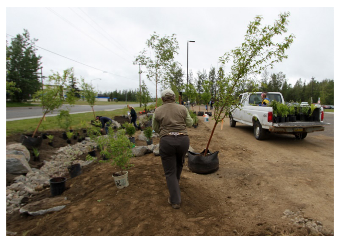
Replacing turf with native species, trees and shrubs can reduce maintenance and fertilization requirements.

Municipal landscaping programs also offer the opportunity to set a good example for residents. To reduce pesticide use and encourage the use of lesstoxic alternatives by municipal crews, King County, Washington, and the City of Seattle began to phase out the use of dozens of pesticides in 1999 as part of an overall pesticide reduction strategy. The decision followed criticism that while the municipalities were urging residents to stop using weed killer and pesticides in yards to help endangered Chinook salmon, they were allowing municipal crews to apply herbicides in municipal parks and along roadsides (Johnson, 1999). Pesticide use and conversion of natural habitat to turfgrass also affects pollinators, which are vital to agricultural production. The Bee City USA program seeks to bolster