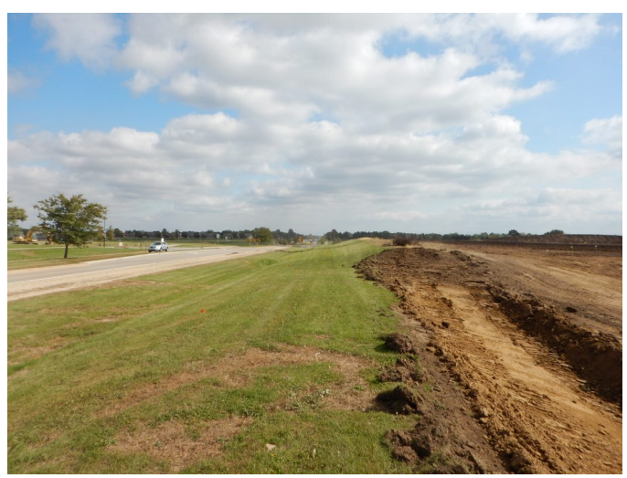
Using a vegetated buffer along the perimeter of a construction site can deter sediment from moving off site.

Additional siting and design considerations include: