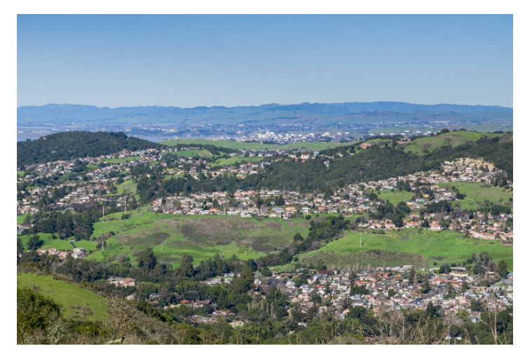
Zoning can be used to target development in specific areas and preserve natural areas.

Zoning techniques include watershed-based zoning, overlay zoning, floating zones, incentive zoning, performance zoning, urban growth boundaries, large lot zoning, infill/community redevelopment, transfer of development rights (TDRs) and limiting infrastructure extensions. Table 1 describes each of these techniques and discusses how they can be useful.