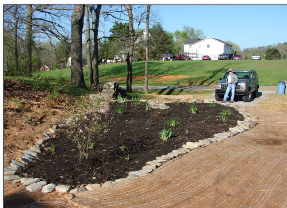
Figure 3. Partners installed a rain garden along College Creek.