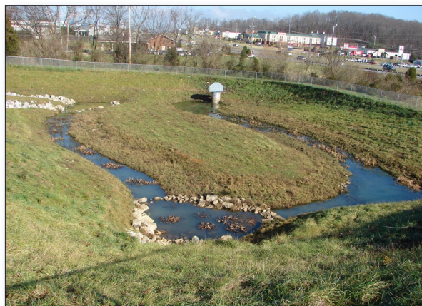
Figure 2. Partners installed a constructed urban wetland pond along College Creek.

Many community partners helped to improve College Creek. Grants through CWA section 319 have exceeded $850,000, with over a third of the total being used to support practices in the Sinking Creek–Nolichucky River watershed. (Note: some contracts included work elsewhere in the Nolichucky River basin.) State support from the ARCF program exceeded $190,000. In addition, the multiple partners provided over $580,000 in cash and in-kind match contributions. Key partners included the Niswonger Foundation, TWRA, City of Greeneville, Town of Tusculum, Tusculum University, Middle Nolichucky Watershed Alliance, multiple SWCDs and local landowners.