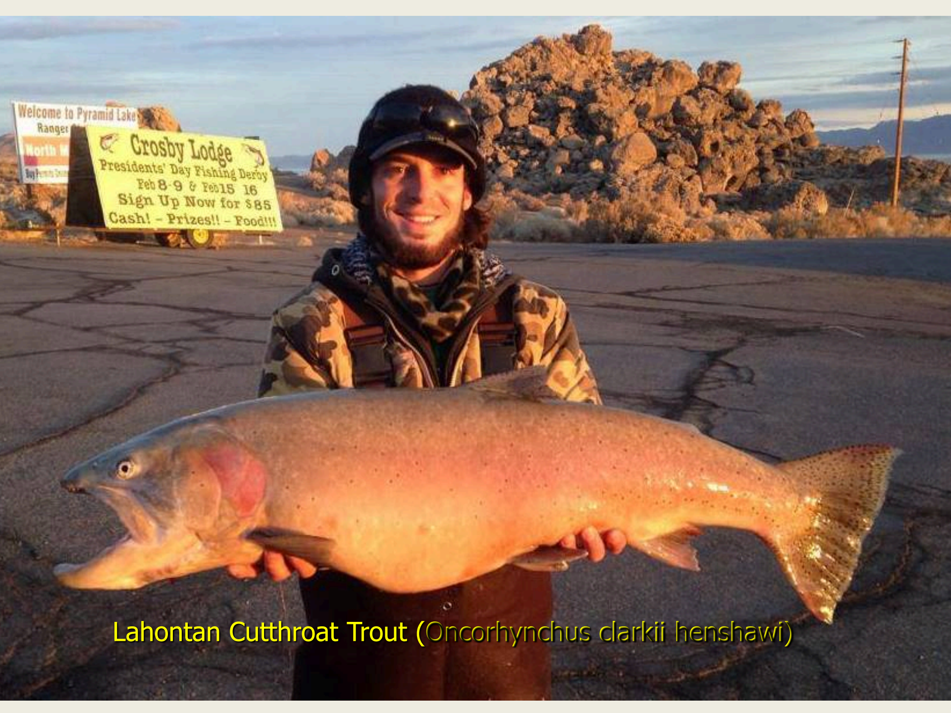
Lahontan Cutthroat Trout ( Oncorhynchus clarkii henshawi )