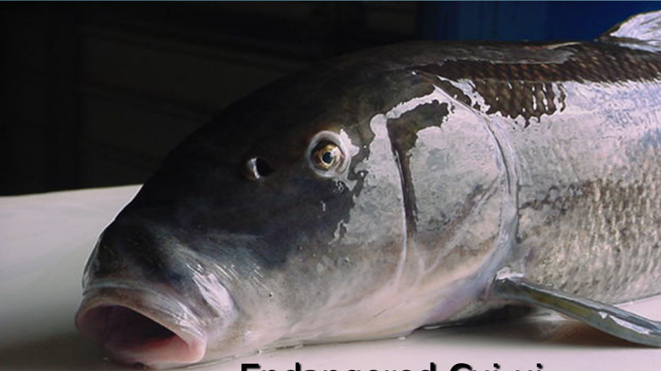
Endangered Cui-ui ( Chasmistes cujus )