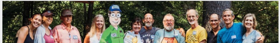
Septic Sam with members of the Tucker Pond Improvement Association.

NEW HAMPSHIRE The Department of Environmental Services took a full-sized cutout of Septic Sam around the state to encourage best decentralized wastewater practices.