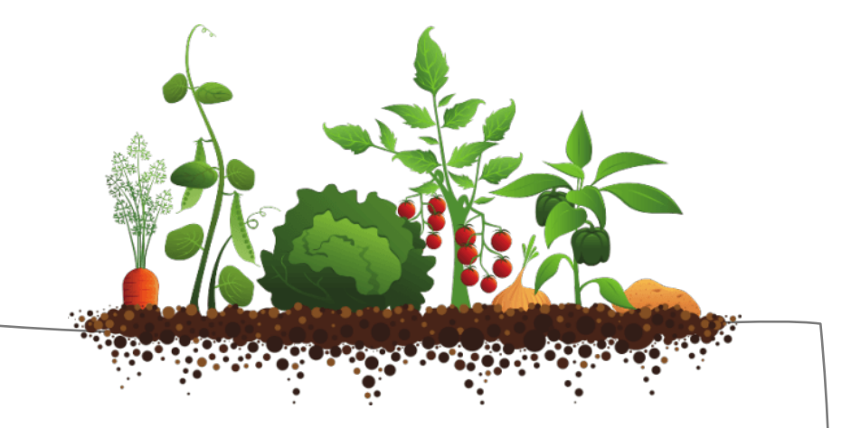
Ensuring the perfect place is also a safe space

Tip: When you need brownfields expertise, a qualified environmental professional (QEP) can help you complete a site assessment. FREE help also is available from <u>State and Tribal programs</u> and the <u>U.S. Environmental Protection Agency's (EPA) Targeted Brownfields</u> <u>Assessments (TBA) program</u>.