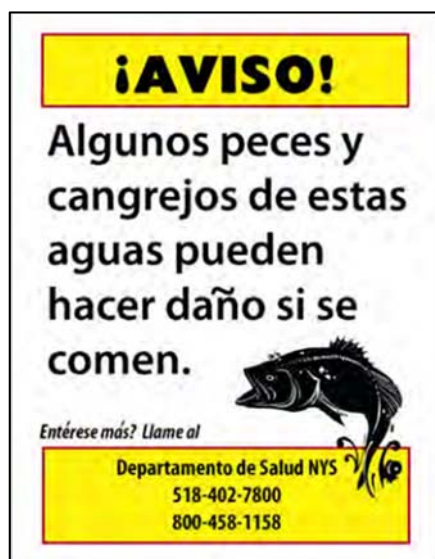
Hudson River Fish Advisory Sign.

An 11 x 17 inch poster, ideal for waiting rooms or community bulletin boards.