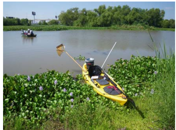
Sampling during the National Lakes Assessment in 2012.

The New York State Department of Health (NYSDOH) provides health advice, or fish advisories, on eating fish people catch. NYSDOH does this because of chemical contamination of some water bodies. In 2008, NYSDOH initiated the Hudson River Fish Advisory Outreach Project, a twenty-year initiative with a goal that all Hudson fish and crab consumers know about, understand, and follow the Hudson fish advisories. The project area extends for