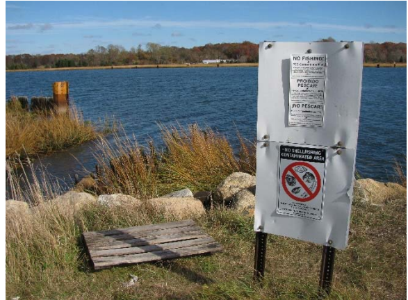
New Bedford Harbor in Massachusetts is contaminated with PCBs from decades of industrial pollution.