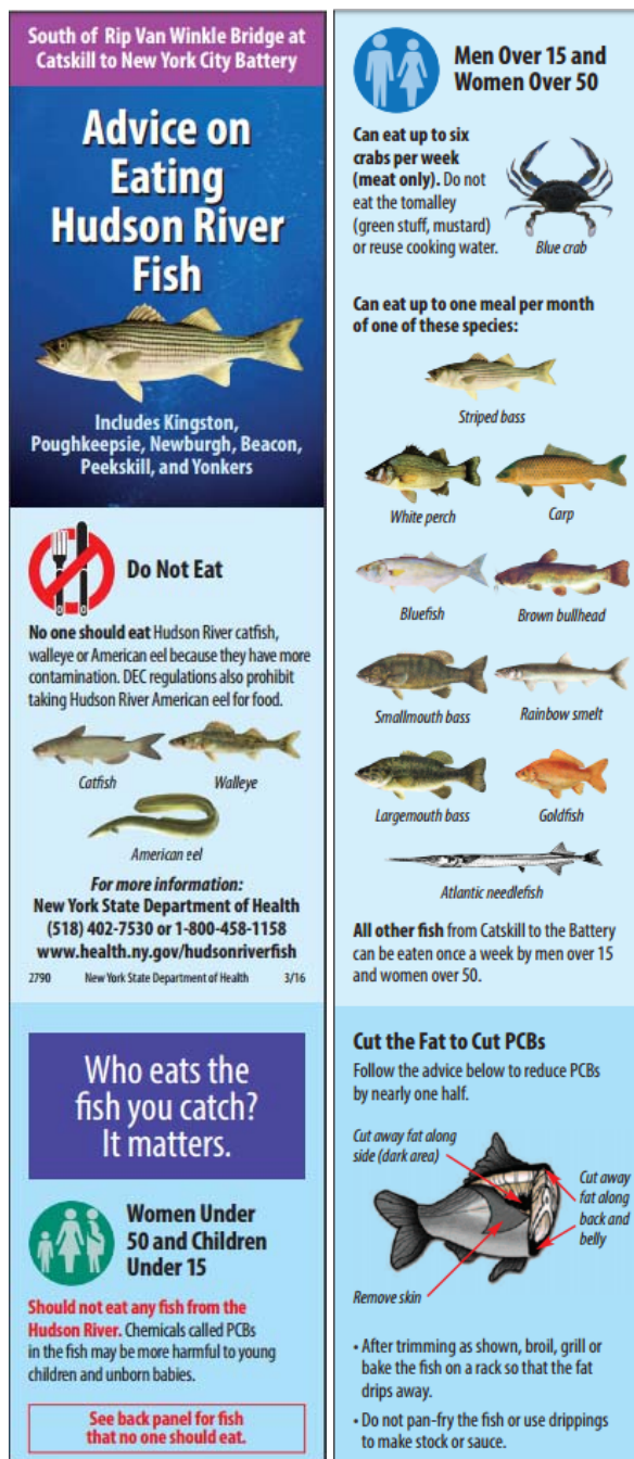
Advice on Eating Hudson River Fish.

A free Hudson River fish advisory sign for NYC Harbor waters to Rip Van Winkle Bridge at Catskill.