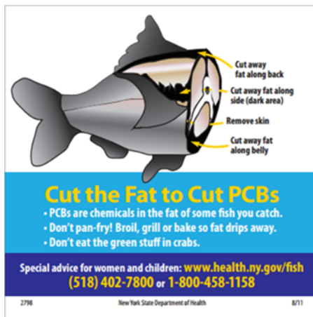
Cut the Fat to Cut PCBs.

A 20-page activity book for classrooms, waiting rooms, and Hudson River community events.