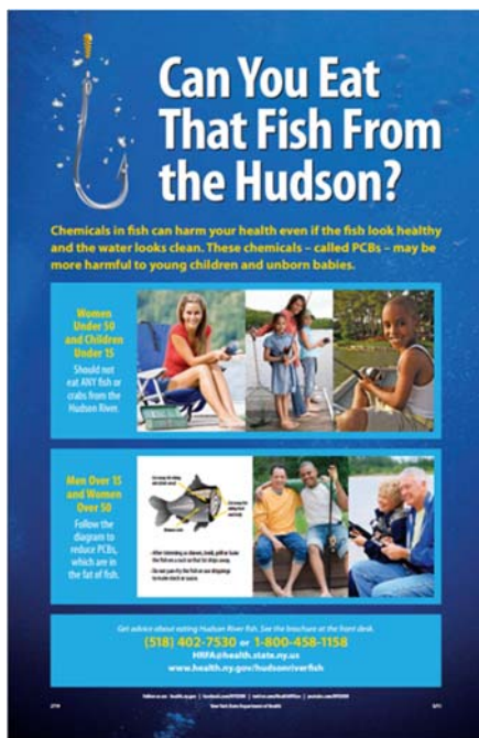
Can You Eat That Fish From the Hudson?

An 11 x 17 inch poster, ideal for waiting rooms or community bulletin boards.