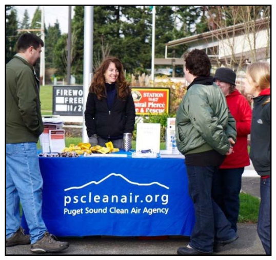
Puget Sound Clean Air Agency community event

Request permission to follow up with households 2 to 3 weeks after the changeout to make sure each household is adjusting to its new appliance. (This may need to be adjusted based on when the stove is installed) There may be questions related to fuel type, flue, doors, or proper venting. A few months later, a complete program evaluation can help provide a better assessment on whether or not the air quality indoors or out has improved. An evaluation also can be