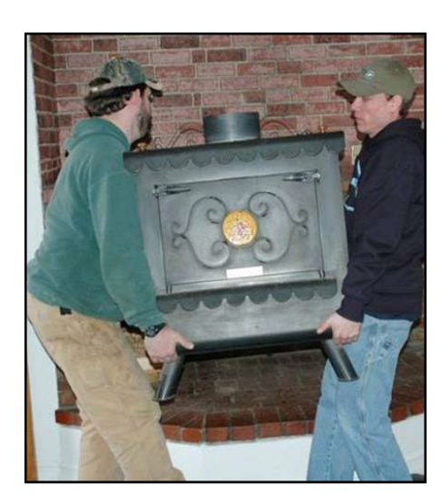
Old Stove Changeout, Libby, Montana

$3,000 to $5,000 for wood stove to wood stove replacement costs (typically $1,500 for appliance and $1,500 for flue and professional installation). Some communities provide total funding to low-income households; others provide vouchers that start at $500 to all households. Some households may require chimney or mantel rebuilds that will cost more than the $1,500 installation estimate. Shipping costs may apply as well, particularly in remote communities. Some areas may want to replace with cleaner burning options such as HVAC (up to $10,000). Explore the option of a bounty program that offers $300 - $500 just to remove an old stove, without any replacement. For more ideas on replacement costs, see Pugent Sound's Heating Replacement Options at https://pscleanair.gov/409/Wood-Stove-Program