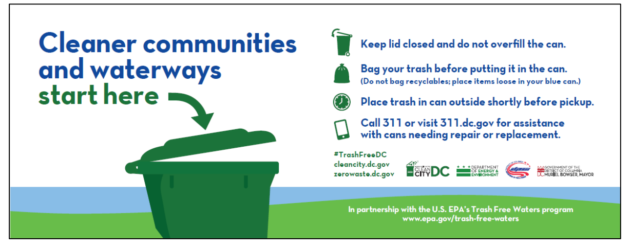
Figure 1. The Curbside Disposal Education Pilot Project campaign sticker design, distributed to 8,000 Washington, D.C. households.