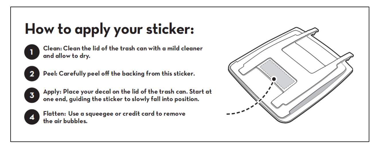
Figure 2. Graphic on the back of the sticker with directions on how to properly apply the sticker on a can.