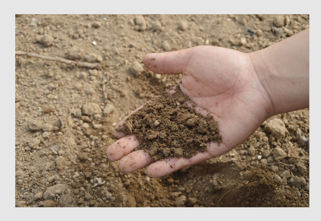
Hello Nature uses a non-hazardous process to convert poultry farm waste into fertilizer. The Anderson facility is dedicated to the production of natural biostimulants.

The site's cleanup transformed a blighted brownfield into an attractive site ready for redevelopment, complete with a new road across the site — Purdue Parkway — and a paved walking/biking path. The city of Anderson, Indiana, is capitalizing on this cleaned-up site to develop innovative commercial, educational and industrial facilities, while also revitalizing the local economy.