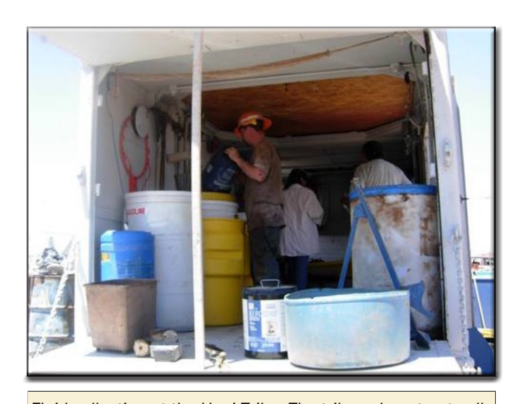
Fluid collection at the Hopi Tribe. The tribe subcontracts all activities to prepare the vehicles for crushing. Fluids are removed from the vehicle and placed into secondary containers. Anti-freeze and oil are recycled. Mercury switches are handled and disposed of as hazardous waste. Gasoline is disposed of by an environmental waste management service.

ous waste management plan that describes how the tribe or the contractor will manage waste in a safe manner and ensures handling of all wastes complies with all applicable federal, state, and local laws and regulations. For examples of a Hazardous Waste Management Plan go to: