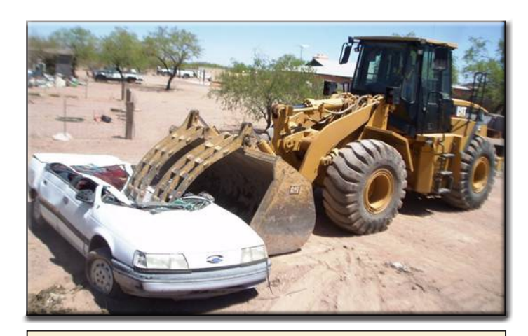
Vehicle collection by the Tohono O'odham Nation. The Tribe owns the equipment to collect the vehicle from where it was abandoned and transport it to a centralized storage area.

Decide if the tribe will process the vehicles or if the tribe will contract with the auto dismantler for processing. Ensure that either the tribe or contractor has a hazard-