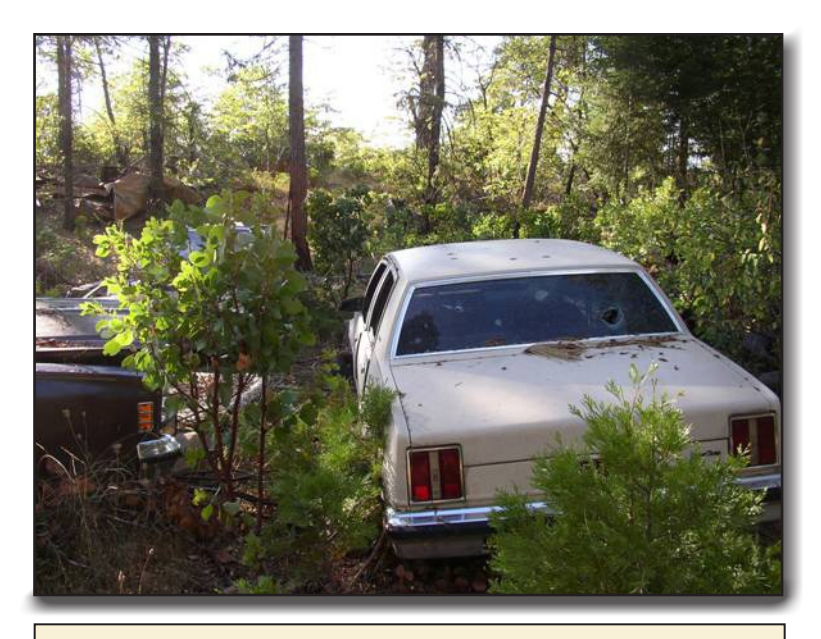
Abandoned vehicle on tribal land

To initiate a successful program, the tribal government should work closely with the community and provide information on the environmental, health, and other hazards associated with abandoned vehicles.