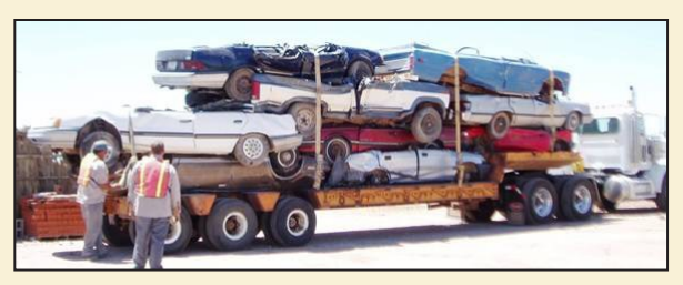
Vehicles being transported to the metals recycler/purchaser