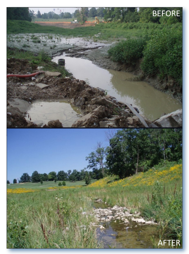
Figure 2. Stream restoration project in Gunpowder Creek watershed.

The Gunpowder Creek watershed received significant partner engagement, catalyzed through the Gunpowder Creek Watershed Plan. In addition to EPA and DOW, key partners include the Boone County Conservation District, the cities of Florence and Union, SD1, NKU, and Kentucky NRCS. In addition to CWA Section 319 program funding ($501,056) for watershed planning, NKU contributed $239,000 towards stream restoration, and Kentucky NRCS funded $94,560 in agricultural BMPs (primarily in the Lower Gunpowder Creek subwatersheds). The lasting impact of watershed planning is evident in ongoing collaborative investments, including installing new stormwater basins, upgrading existing stormwater basins (retrofits), constructing a bankfull stormwater wetland (2017), and adding stream exclusion fencing for livestock. Multiple stormwater improvement projects are being developed with SD1, the City of Florence, NKU, and the Cincinnati/Northern Kentucky International Airport—these are likely to improve water quality for years to come.