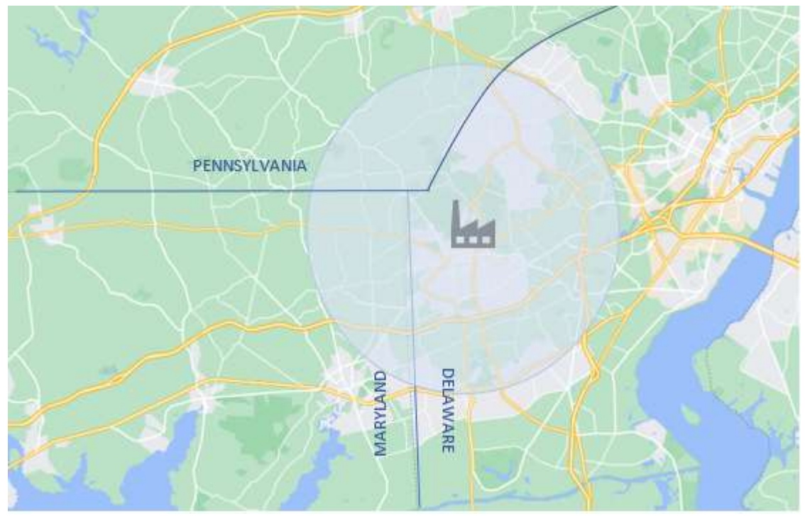
Figure 1. Hypothetical scenario of an emissions plume crossing state boundaries (not to scale)

The RSEI facility-level and the RSEI Microdata datasets are both based on the same underlying modeling, and as a result, total RSEI-modeled result values will be the same at the national-scale level in either dataset. The facility-level dataset is appropriate for prioritizing chemicals, facilities, industries, and pollution prevention opportunities or for screening for situations that may warrant further investigation. Ranking or looking at trends for geographic areas can be useful as long as users understand the nature of the RSEI facility-based data.