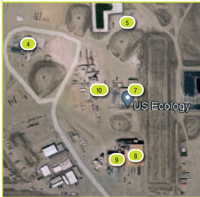
Figure 2 - Units Approved for PCB Waste Management