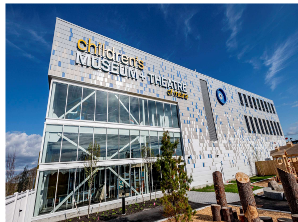
The Children's Museum and Theatre of Maine.

Site assessments conducted with EPA and private funding between 2012 and 2018 identified contaminants in the soil and helped to develop a cleanup plan for the Site, thanks to the support and guidance of the Maine Department of Environmental Protection. Due to decades of industrial use at the Site, contaminants such as polycyclic aromatic hydrocarbons (PAHs), arsenic and petroleum were found in soils at the Site and threatened to significantly increase the cost of the project. Luckily in 2019, the Children's Museum and Theatre of Maine was awarded a Brownfields cleanup grant for $500,000 on their first attempt at applying for this sort of federal funding. In addition, both the City of Portland and the Greater Portland Council of Governments contributed funds to the cleanup from their EPA-funded Brownfields revolving loan fund programs.