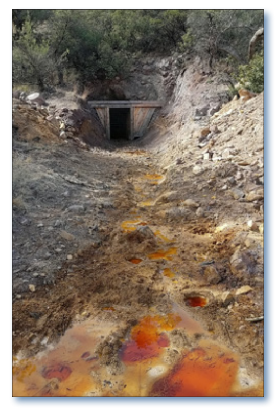
Figure 2. The adit at Lead Queen Mine, before remediation.

Entry to the open shafts were closed with bat-friendly gates, while others were sealed using polyurethane foam. A total of 11 zeolite gabion basket structures were installed in the stream channel at various locations downstream of the main adit in order to mitigate stormwater contact. However, the remedy at the main adit began to fail, allowing discharge of pollutants. USFS investigations discovered that the foam plug was intact, but that fractures and faults near the opening were seeping tunnel discharge that was then flowing downstream. USFS built a retention basin to contain and treat the small seep and flow. In 2019, USFS installed a hydraulic plug—a more long-term solution—to cease the discharge. Subsequent site visits confirmed no new seepage coming from the former adit opening.