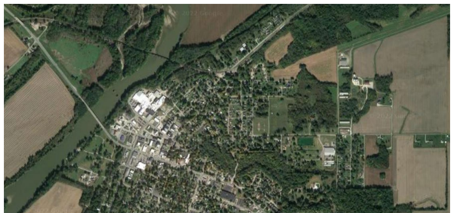
Radio Materials Corporation, Attica, Indiana

EPA has issued the Statement of Basis document to share with the public the details of the Site's history, the studies that have been completed, and a detailed description of the cleanup items proposed above. That document, along with the Site's legal Administrative Record, is available online at Hazardous Waste Cleanup: Radio Materials Corporation Facility - Attica, Indiana | US EPA