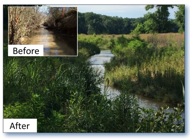
Figure 2. McDowell Creek (Birkdale to Gilead) stream restoration project.

MCSWS also conducts annual benthic macroinvertebrate assessments at two monitoring locations (see Figure 1) on the main stem. Monitoring data from these sites, one of which coincides with the NCDWR sampling location, shows higher average EPT indices between 2017 and 2021 compared to the previous five years.