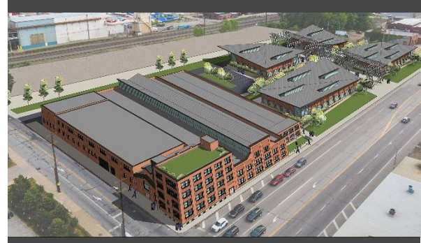
Rendering of the redevelopment plan for the Former Erie Malleable Iron site.