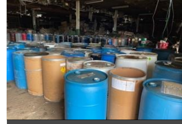
Waste drums and chemical laboratories discovered in the Former Erie Malleable Iron site.