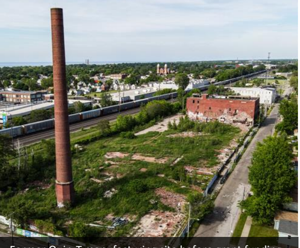
Former Quin-T manufacturing site before grant funding

"Just as a human being this was the most important project. There were children playing in there."