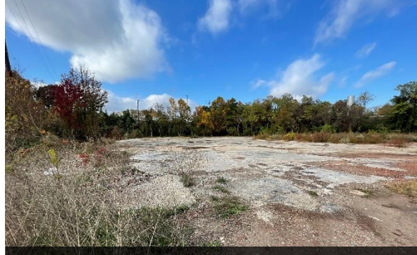
The past location of the Aaron Street Furniture Plant and future site of a 55-unit senior living facility.