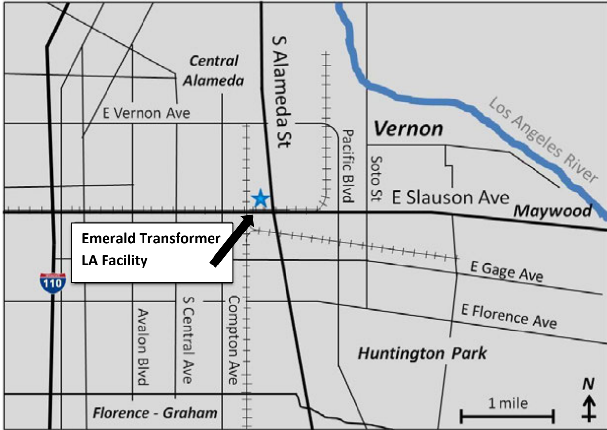
Figure 1 – Site Location Map