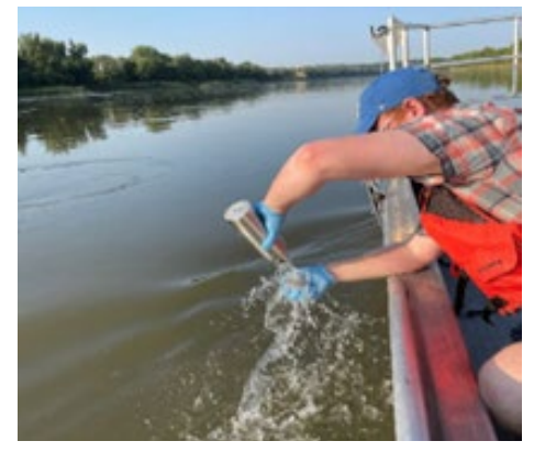
Microplastics sampling along the Missouri River.

On September 14, 2022 another sampling event was conducted at ten sites in urban areas along the Missouri River, Blue River, and Kansas River. The samples were collected along 36.5 total miles of water to test for microplastics upstream and downstream of wastewater treatment discharge sites during a low-flow event. Project partners are awaiting results from the ORD analysis. Another round of microplastic sampling took place in October 2022 during a high-flow event.