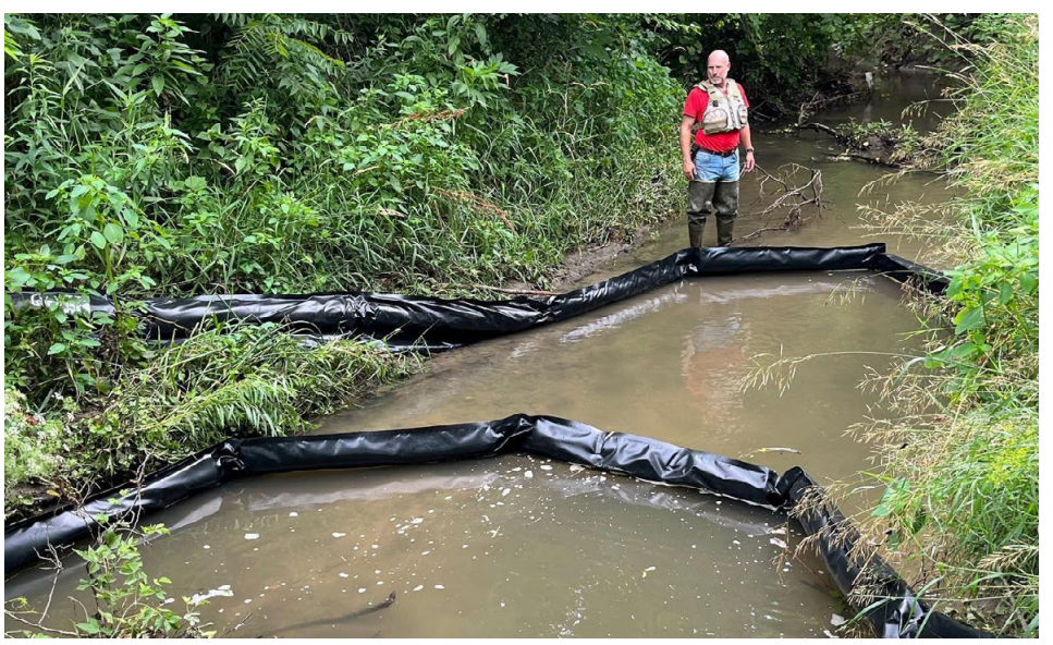
Osprey Initiative installing a litter boom in a local Davenport creek.

In 2022, EPA embarked on a Marine Litter Project with the Commission for Environmental Cooperation to prevent marine litter by demonstrating, educating, and communicating about the flow of marine litter from inland communities to the marine environment. The city of Davenport, Iowa was selected as one of three North American sites for this pilot project, the others including Sumidero Canyon National Park near Tuxtla Gutierrez in Mexico, and Rideau Canal in Ottawa, Canada. As a part of this initiative, a company called the Osprey Initiative installed four "Litter Gitter" trash capture devices in three different Davenport creeks in Summer 2022. Throughout the fall, the Osprey Initiative maintained and collected data from the devices. In October, project partners joined forces with Xstream Cleanup and the Mississippi River Cities and Towns Initiative (MRCTI) to host a community cleanup and data collection event. The next phases of the project will