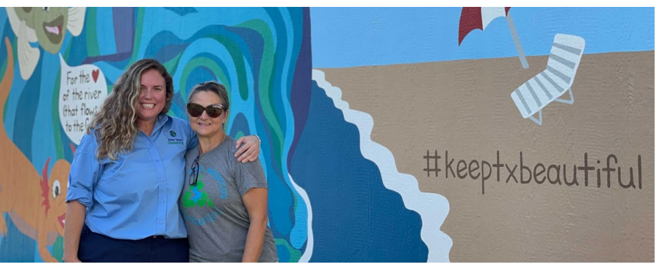
Educational mural in San Marcos.

education and activity book currently in production. Other San Marcos projects include the construction of a gabion wall behind a busy truck stop that was polluting a major feeder creek and conducting various hot spot cleanups and litter audits throughout the community. Partners also engaged with the local university, Texas State University, to spread more awareness and increase litter and recycling programs on campus. As of September 2022, three waterway cleanups have been hosted in the area, engaging 56 volunteers and resulting in the collection of 1,077 lbs of litter.