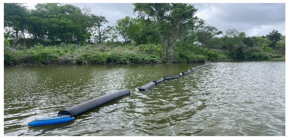
Litter boom system installed in the Houston-Galveston watershed.

In Central Texas, KTB focused on San Marcos, a college town about an hour south of Austin. This town is home to the San Marcos River which features endangered flora and fauna like Texas wild rice, Texas blind salamanders, San Marcos gambusias, and fountain darters. KTB partnered with Keep San Marcos Beautiful to accomplish a variety of activities including creating an educational mural near San Marcos' busiest recreation entrance. This mural depicts two of the endangered fauna as cute cartoon characters and encourages visitors, "For the love of the river, pick up your litter!" These characters will also be featured in a youth