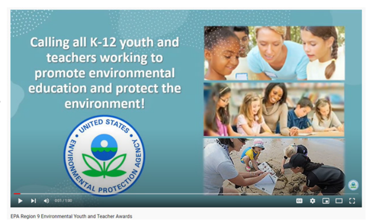
Check Out the Youth and Teacher Award Information Video!

The President's Environmental Youth Award (PEYA) The Presidential Innovation Award for Environmental Educator (PIAEE) Learn more about the challenge at epa.gov/ education Environmental Youth and Teacher Awards Informational Video