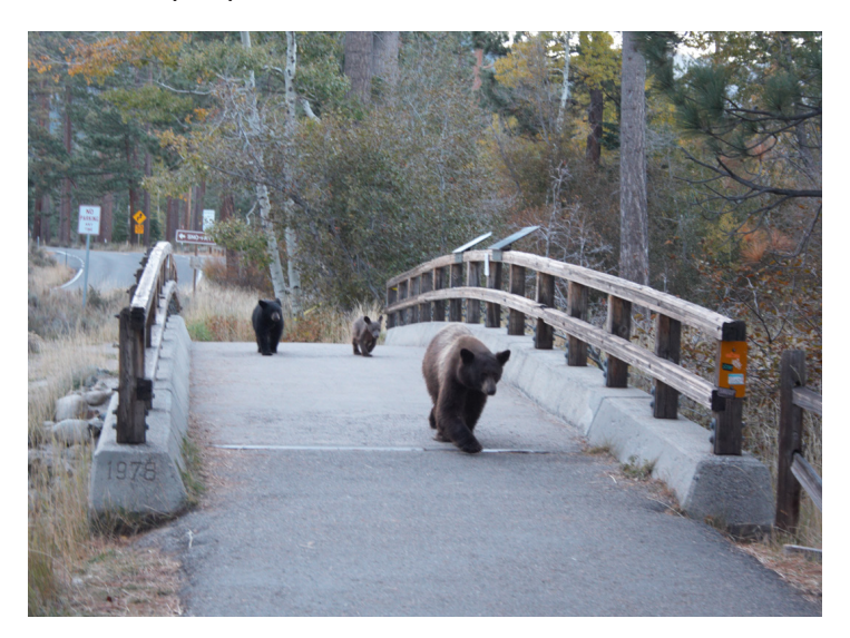
Bears spotted at Taylor Creek (Dawgašašíwa in the Washoe language) during a hike after a day of sessions at the 2022 Tribal/U.S. EPA Region 9 Annual Conference.

Over 600 people from tribes, the U.S. EPA, federal and state agencies, universities, and more attended either in