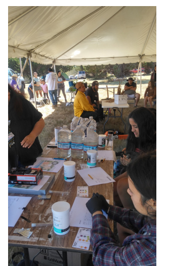
Water quality testing demonstration back at the campsite.

Seventeen local tribes and five outside organizations collaborated in planning and faciliting the event. As head facilitators, the PVT Environmental Office set a zero-waste goal for the event. After a two-year hiatus due to the COVID-19 pandemic, this year's gathering was one of the most successful campouts. Over 16 workshops covered environmental, cultural, and Traditional Ecological Knowledge (TEK) themes, as well as sports, health, and wellness activities. Workshops included sessions