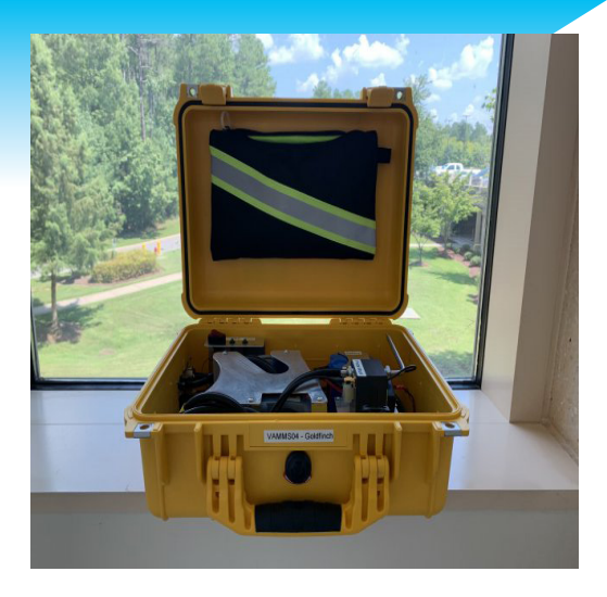
The U.S. EPA's VAMMS system.

The challenge is open now and all entries must be submitted by February 17, 2023 .