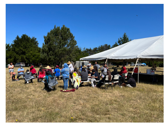
Many of the 16 environmental workshops were held in the tent near the middle of the campground.

2019 InterTribal Environmental Youth Campout Video