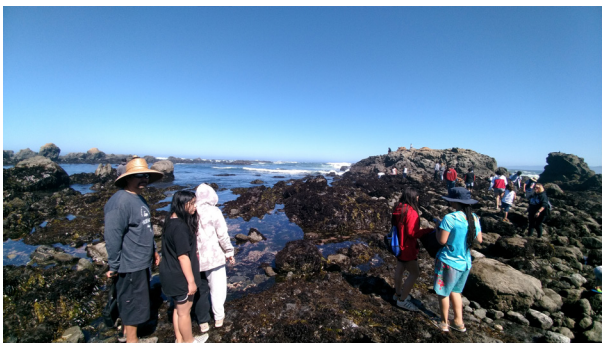
Tide pool field trip during the lowest tide of the week.

on vermiculture, water resources, solar technology, geocaching, composting, salmon lifecycle, tribal dancers, and two organized water resource activities—