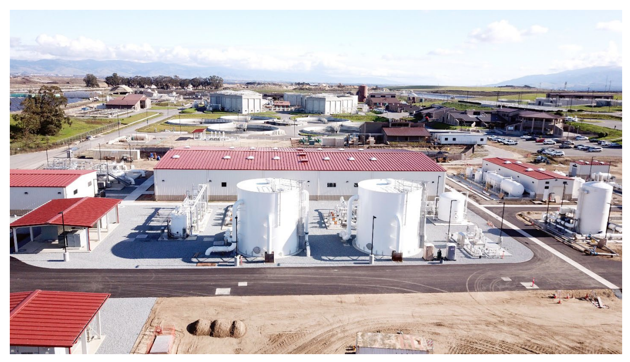
The Pure Water Monterey project in Central California uses municipal wastewater, stormwater, agricultural drainage, and agricultural wash water in its potable reuse facility to replenish the Seaside Groundwater Basin.

Stormwater runoff from rain and snowmelt events that flow over land or impervious surfaces is often viewed as a nuisance or a drainage problem for communities to manage. As some communities face water stress, stormwater is increasingly being viewed as a resource that can be captured, treated, and used for different purposes. Among these end-uses is aquifer recharge through EAR or ASR. While the availability of stormwater is intermittent and dependent on climatic conditions, it can significantly contribute to a local water supply. For example, in California it has been estimated that up to 3 million acre-feet per year of stormwater is available for capture in the urban areas of California, depending on the amount of rainfall, in a given year. This is roughly on par with the potential for enhanced urban water efficiency and wastewater reuse (Cooley et al., 2022). With climate change projected to increase the frequency and severity of rain events as well as drought (Lall et al., 2018), capturing stormwater when it is available may become more crucial to supporting sustainable groundwater supplies. Much like municipal wastewater, stormwater has different chemical and microbial constituents that can pose risks to groundwater quality through EAR or ASR applications. Details on treatment needs and other considerations are largely dependent on site-specific conditions and more detail on the use of stormwater in EAR can be found in <u>EPA's Stormwater EAR Report</u>.