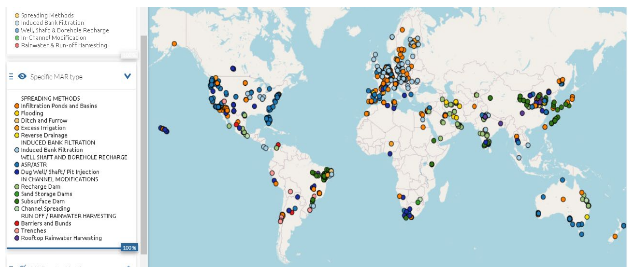
Figure 1: EAR projects throughout the world (Stefan and Ansems, 2018)

EAR and ASR are also increasingly common outside the United States as a water management strategy, as seen in the map of EAR projects which includes ASR, throughout the world (Figure 1, Stefan and Ansems, 2018). The map shows a broad mix of project types in Europe, the United States, China, and elsewhere. (The database used to produce Figures 1 and 2 can be found at <a href="https://ggis.un-igrac.org/view/marportal">https://ggis.un-igrac.org/view/marportal</a>.)