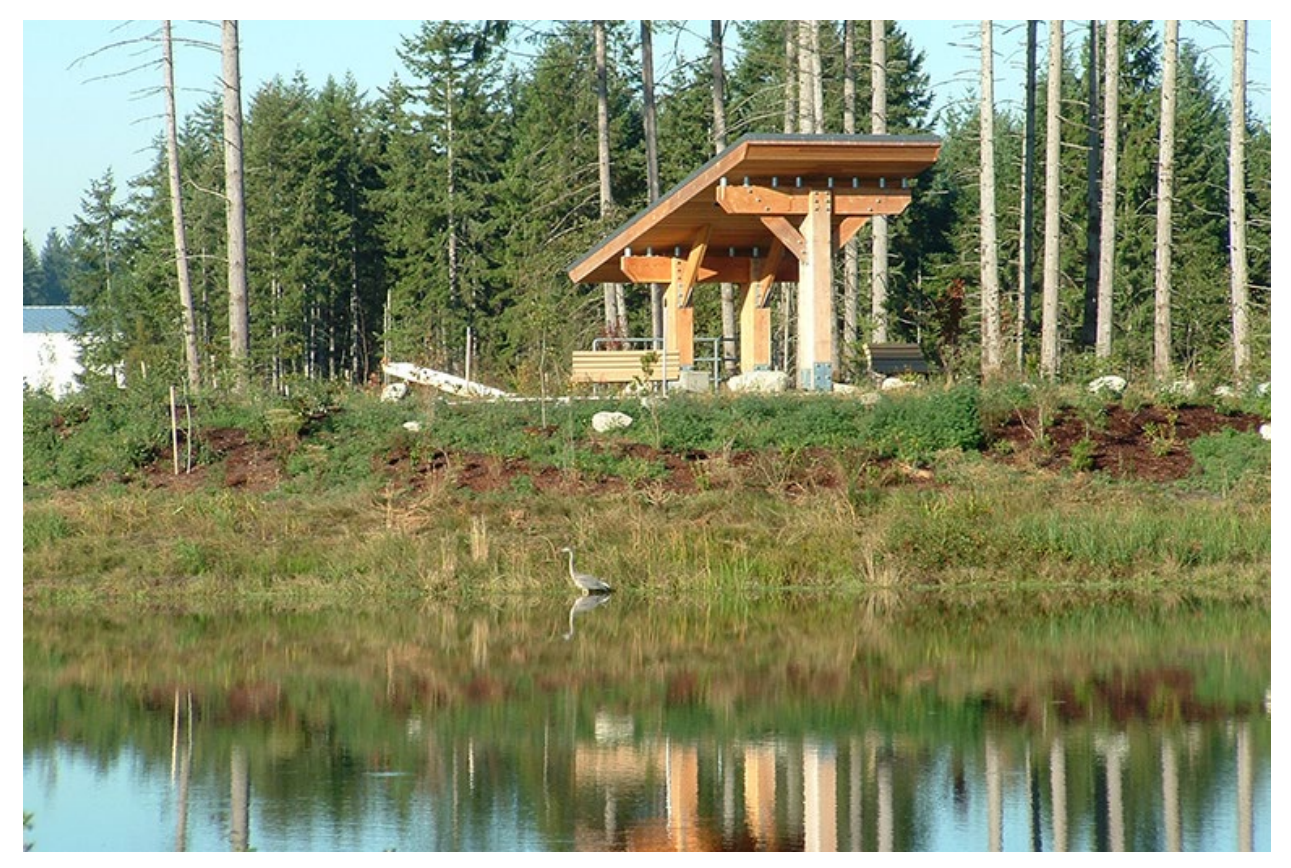
At the Hawks Prairie Ponds in Lacey, Washington, reclaimed water flows through several wetland ponds before entering groundwater recharge basins.

A common legal consideration for EAR and ASR projects using recycled water is water rights. Each state has its own system for determining who has the legal right to surface water and how much they have the right to use. In general, states in the East (e.g., east of the 100<sup>th</sup> meridian) apply the riparian doctrine, which generally means that water belongs to the person whose land borders a body of water; this person may make reasonable use of that water as long as it does not unreasonably interfere with reasonable use by others with rights to use of this water (National Agricultural Law Center, 2022). In the West (e.g., west of the 100<sup>th</sup> meridian), the prior appropriation doctrine is generally used. This doctrine can be summarized by the phrase "first in time, first in right," meaning that the first person to use or divert water for beneficial use can obtain rights to that water (National Agricultural Law Center, 2022). Some states, such as California and Oklahoma, have adopted a hybrid of the riparian and prior appropriation doctrines (National Agricultural Law Center, 2022). While this simplistically defines the issue, the nuances could affect a community's ability to use recycled water for EAR or ASR and may require consultation with water law experts in each state.