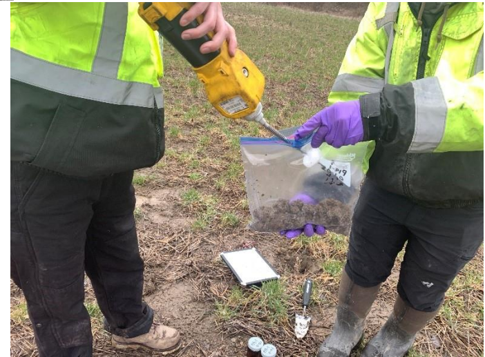
4. Soil from the bags is then placed into small glass jars that will be sent to an EPA-approved lab to test for semi-volatile organic compounds (SVOCs) and dioxins. EPA periodically splits the soil samples for testing at a separate laboratory.