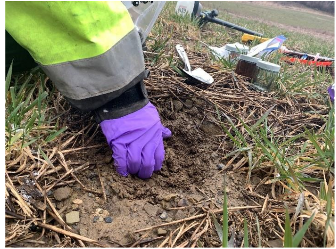
2. If crews find ash or soot, they will sample the soils on the surface and collect a shallow subsoil sample. Using a clean hand trowel, the subsoil samples are collected from 1 to 6 inches into the ground.