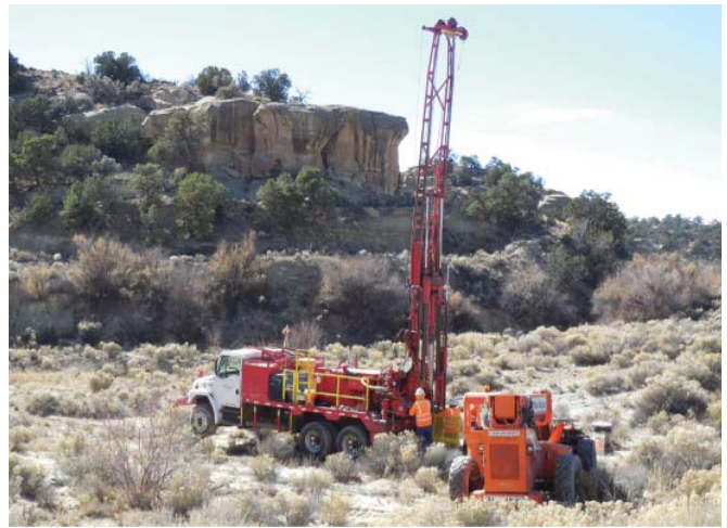
GE contractors take samples on the Northeast Church Rock Mine site.

NRC must approve the request for a license amendment at the UNC Mill Site before the NECR Mine Site cleanup construction can begin. The NRC currently estimates a license decision in January 2022. Cleanup construction is anticipated to take approximately four years to complete.