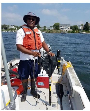
Left: Water quality buoys help researchers measure physical, chemical, and biological properties of water in Shubael and Hamblin Ponds. Right: EPA scientist Darryl Keith with the in-water HyperSAS profiling radiometer system which measures the spectrum of the underwater light field. The HyperSAS spectral signatures will provide in-water validation of remote sensing algorithms to map seagrass density and estimate phytoplankton and cyanobacteria concentrations derived from satellites, aircraft, and UAV data.

modeled after the Fast Limnology Automated Measurement (FLAMe)<sup>1</sup> platform developed at the University of Wisconsin. The EPA system is being used once or twice a month, taking measurements approximately every 20 meters across each pond, and is measuring the same physical, chemical and biological properties as the buoys to provide complementary data.