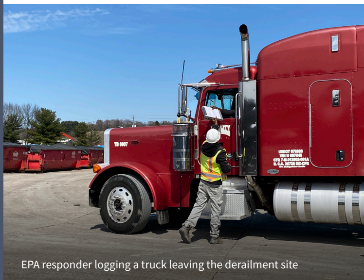
EPA responder logging a truck leaving the derailment site