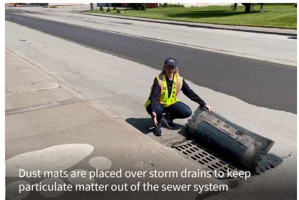
Dust mats are placed over storm drains to keep particulate matter out of the sewer system

Dust mats are used over the inlets on the roadways around the derailment site to keep particles, such as dust and dirt, out of the stormwater sewer system. The system, which collects water from sources, such as rainfall, water trucks, and snowmelt, discharges directly to the local creeks and tributaries. Excessive particles, such as dust, in the storm sewer catch basin can clog the catch basin and block water flow, so it is important to keep them from entering the system. If you see these mats around town, please do not remove them as they are helping to protect water bodies and aquatic habitats. The storm sewers do not connect to the pipes in your house.