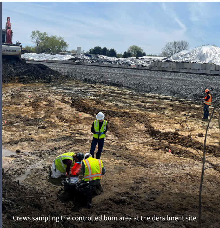
Crews sampling the controlled burn area at the derailment site