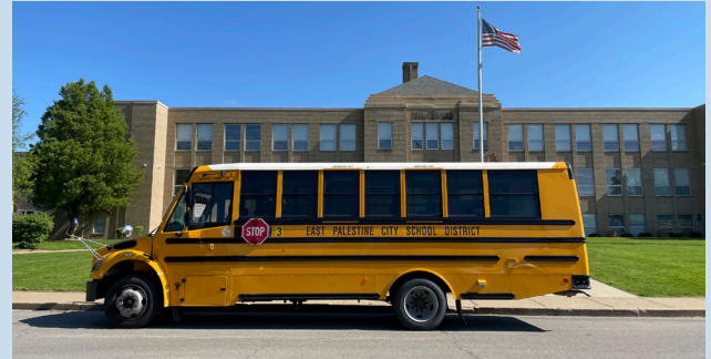
East Palestine High School "Go Bulldogs!"

EPA community involvement coordinators visited an East Palestine High School science class last Tuesday and presented on the response, including progress made at the train derailment site. Students discussed their air-quality findings from the PurpleAir and Air Beam sensors EPA loaned them earlier this year. One student noticed slightly elevated levels of particulate matter during some evenings, which could have been from pollen or bonfires. During the Q&A period, students asked thought-provoking questions about track excavation and interpreting air sensor results.