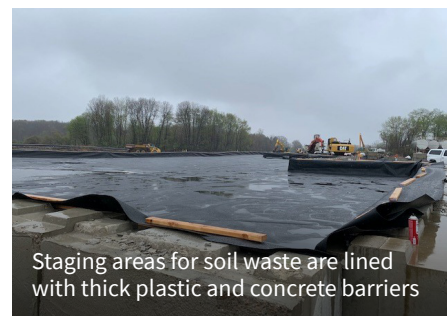
Staging areas for soil waste are lined with thick plastic and concrete barriers

information about the extent of the contamination from the derailment so plans can be made to remove it.