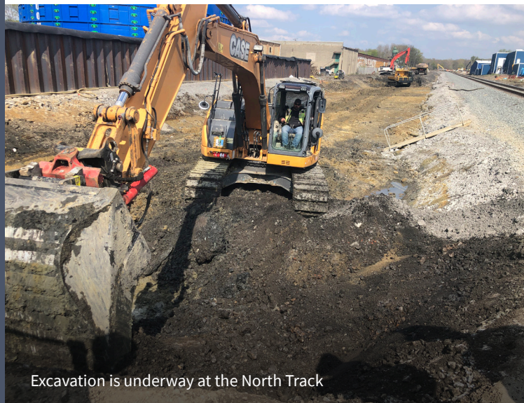
Excavation is underway at the North Track