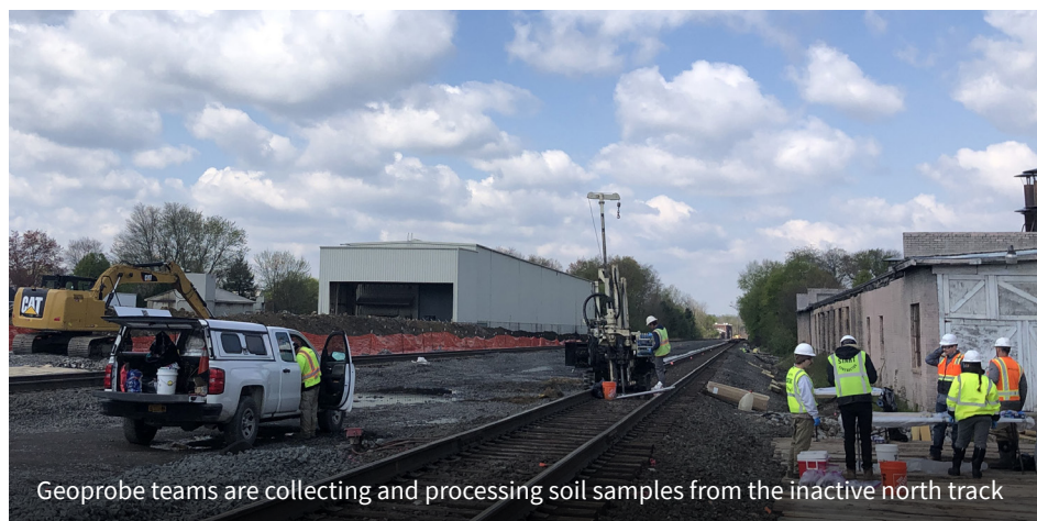
Geoprobe teams are collecting and processing soil samples from the inactive north track