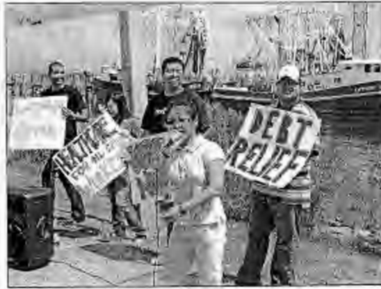
Regional Focus Conference to support regional Vietnamese American Fisherfolk held on June 15, 2010 in Biloxi, MS.

In solidarity with the struggles of New Orleans East, residents of Alabama, Mississippi, and Louisiana are engaged, passionate, and concerned about their health and that of the environment. The April 2010 Deepwater Horizon BP oil drilling disaster compounded the fears and concerns of the communities regarding the human and environmental health. The health of the workers cleaning up the disaster should be a priority.