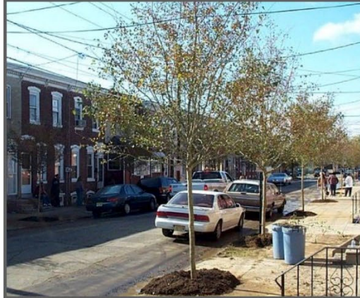
Royden Street, Camden after trees in 2002