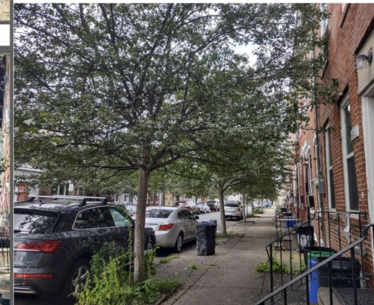
Royden Street, Today

An example of a street tree project in Camden, NJ. We plant solely at resident's request in the Garden State's most vulnerable neighborhoods.