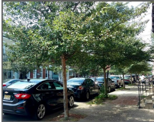
Royden Street, Camden in 2017