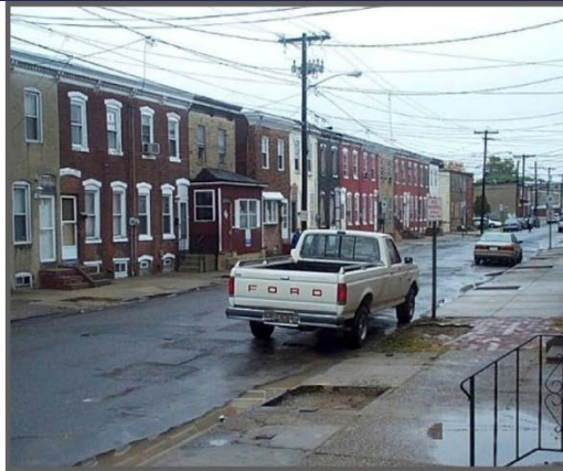
Royden Street, Camden before trees in 2002

Urban Airshed Reforestation Program/ Renaissance Trees Program/ Green Streets