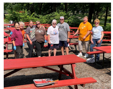
City Lake building team and picnic table paint crew

71,595 est. tons of solid waste shipped offsite