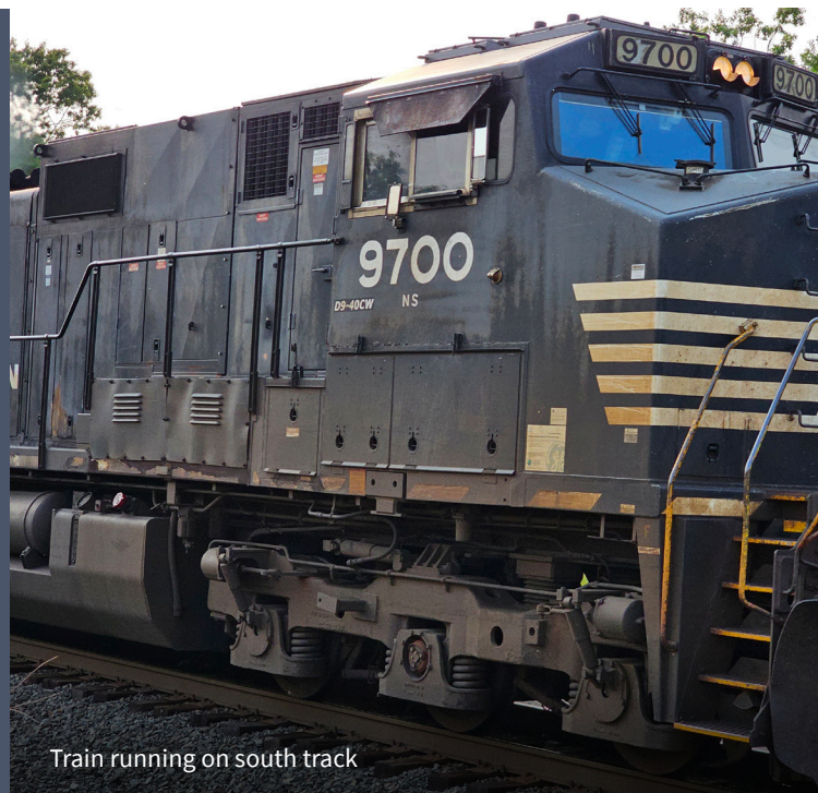
Train running on south track