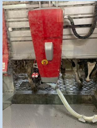
The robotic milking machines at Baker's Golden Dairy

Eastern Ohio and Western Pennsylvania are home to many farmers and ranchers. Recently, EPA and other agencies supporting the response visited two area farms to learn more about their operations. Baker's Golden Dairy in New Waterford uses two robots to milk their Holstein cows. The process is very efficient as cows walk up to the machines on their own when they are ready for milking. In Darlington, Tall Pines Farm raises grassfed hair sheep and has over 40 head of cattle. The animals rotationally graze, first the cattle and then the sheep.