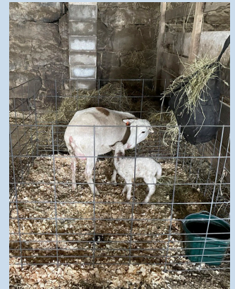
A newborn baby sheep and her mother at Tall Pines Farm