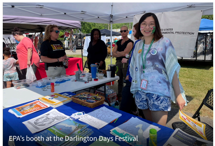
EPA's booth at the Darlington Days Festival