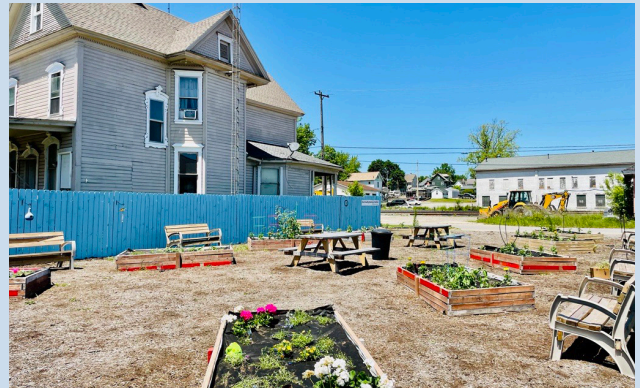
Threshold Residential Services sensory garden near Taggart St.

The Threshold Residential Services community sensory garden recently opened on the south side of Taggart Street. This garden is a safe, relaxing, and interactive space open to the whole community. Designed to engage and elevate the senses, this garden enhances the lives of people with developmental disabilities and their families. By immersing yourself and your senses in gardening, you will activate different areas of the brain while learning about the environment. This beautiful and interactive garden will continue to grow and eventually bloom, so keep an eye out!