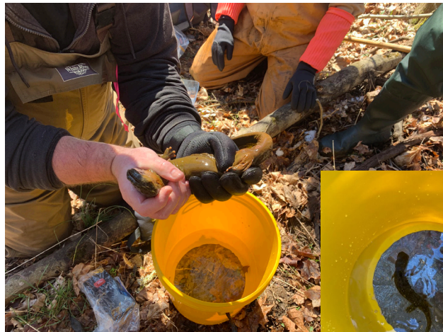
Ohio EPA recently found an endangered hellbender salamander

The hellbender salamander is the largest amphibian in North America and is found in Pennsylvania, Ohio, and West Virginia. The hellbender is the state amphibian of Pennsylvania and is an endangered species in Ohio. Like Peter Pan, a hellbender never wants to grow up. While other salamanders' larvae complete metamorphosis and move onto land, hellbenders go through a partial metamorphosis. At 18 months, they lose their gills but stay in water, breathing through their wrinkly skin. For food, hellbenders eat local crayfish and are always happy to enjoy a snack that travels to them. While much is not known about the hellbender, we do know that they can live for over thirty years.