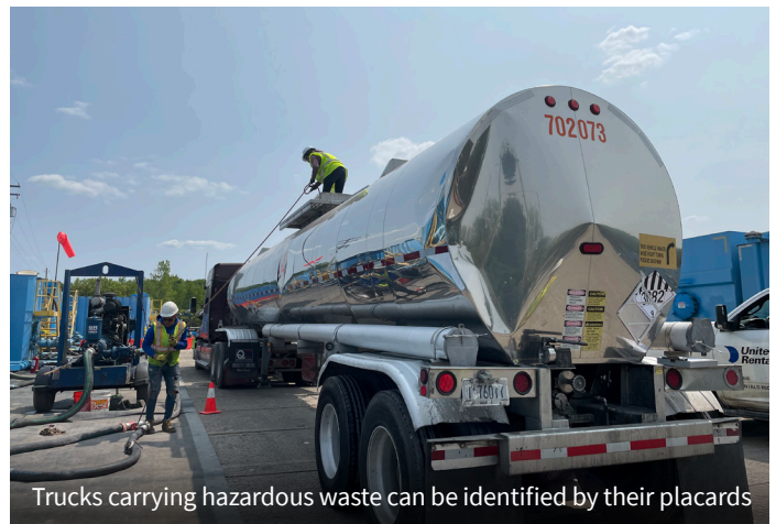
Trucks carrying hazardous waste can be identified by their placards

When soil waste is loaded or staged there may be increased vapors. Continuous air monitoring is done to ensure the air remains safe. Also, a vapor suppressant foam is used on active piles to reduce odors. Some chemicals of concern, such as butyl acrylate, have a low odor threshold and can be smelled below levels of concern.