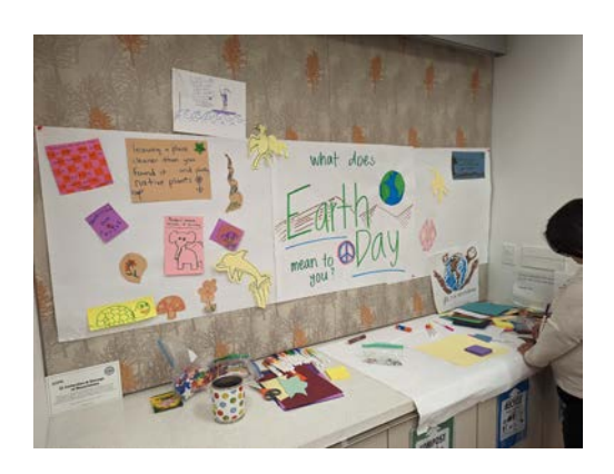
RTOC attendees get creative to celebrate Earth Day.

Region 9 RTOC Meeting Materials: Spring 2023 | U.S. EPA