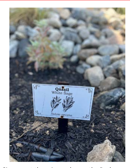
Signage at the rain garden on the Pechanga Reservation funded by competitive Clean Water Act 319 funds.

The EPA is offering a free, in-person training on how to plan, develop, and operate small-scale transfer stations. Are you considering building a