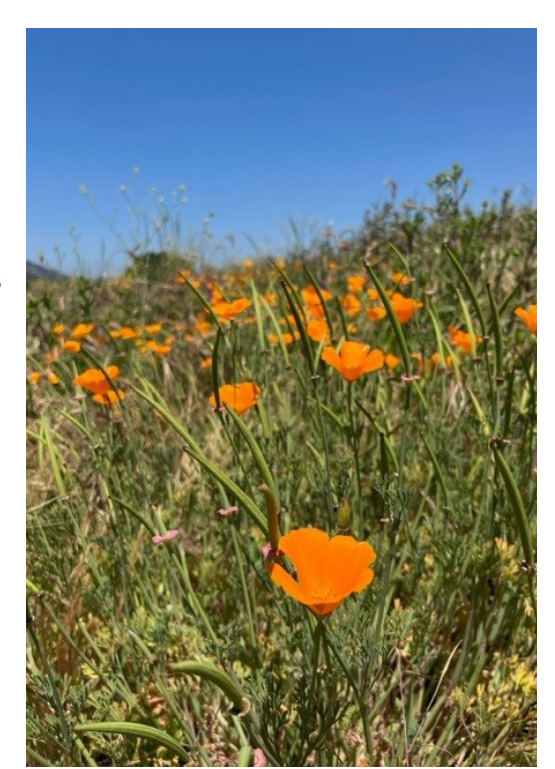
Golden poppies on the Pechanga reservation.

In the past year, we've been fortunate to receive Bipartisan Infrastructure Law resources that expand highly successful programs like Brownfields and create new ones like Solid Waste Infrastructure for Recycling and Recycling Education and Outreach. These programs invest in assessments and cleanup of Brownfields properties, waste reduction, recycling, composting, and sustainable materials management. The need for these resources is great, and the EPA received strong interest and applications for funding from tribes in Region 9 and across the country. The EPA recently announced the FY23 Brownfields grant recipients, and we expect solid waste grant announcements soon. We anticipate more Brownfields opportunities in the fall and hope that EPA will offer similar solid waste and recycling opportunities again in the future. Information on these and other specific EPA grant programs and assistance can be found on the EPA's grant programs website. The EPA and Region 9 have also been focusing resources on assessing and remediating leaking underground storage tank sites on tribal lands. The EPA's Underground Storage Tank Finder web map contains comprehensive underground storage tank and leaking underground storage tank data