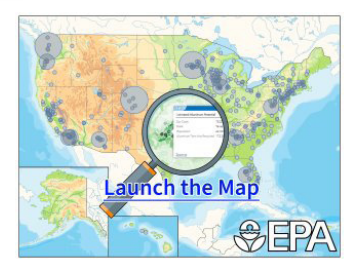
Launch the map at the link provided.

By providing a comprehensive resource for understanding opportunities related to post-consumer materials management, this first version of the Recycling Infrastructure and Market Opportunities Map can help develop and strengthen primary and secondary end markets for materials, support cleaner communities by reducing the