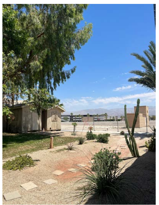
The rain garden at the Cabazon Reservation funded by Clean Water Act 319 funds.

<u>Tribal Consultation Opportunities Tracking System Website | U.S. EPA</u> <u>Policy on Consultation and Coordination with Indian Tribes (2011) | U.S. EPA</u> <u>Guidance for Discussing Tribal Treaty Rights (2016) | U.S. EPA</u>