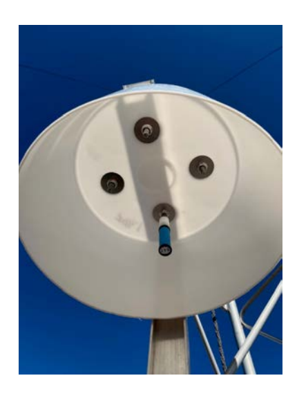
Close up of the AMoN instrument.

The air program uses a BAM 1020 and a Teledyne T400 Ozone Machine. Our most current project is working with CASTNET, which has been very exciting for us as it provides a regulatory ozone monitor. CASTNET is currently a 100-site network, with 31 of them in national parks. La Posta will be the 8th tribal CASTNET site and the first tribal site in EPA Region 9.