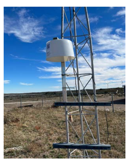
AMoN instrument on an air quality monitoring tower.

Website | U.S. EPA Region 9 Tribal Air Programs in the Pacific Southwest