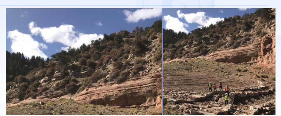
USEPA constructed erosion controls at the Mesa II mine to prevent mine waste from entering the Cove watershed. Before erosion control (left), and after erosion control (right).

Funds are available to begin the cleanup process at 127 mines, approximately 55 percent of the mines in the Northern AUM Region, including all 17 priority mines. USEPA continues to look for companies responsible to assess and clean up the remaining mines in this region.