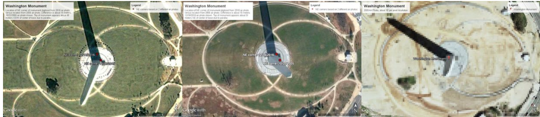
Example of parallax distortion error