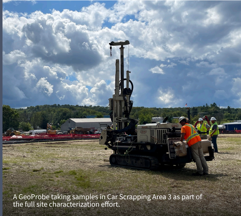
A GeoProbe taking samples in Car Scrapping Area 3 as part of the full site characterization effort.