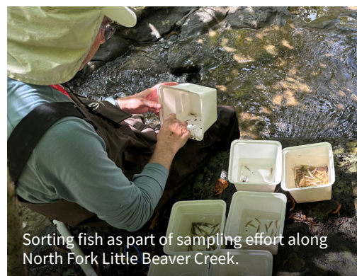
Sorting fish as part of sampling effort along North Fork Little Beaver Creek.

Ohio EPA is overseeing an assessment of surface water that may have been affected by the train derailment. Biological sampling assesses fish, habitat, macroinvertebrate and native mussel communities in surface waters. Fish and habitat sampling is complete in Leslie Run and will continue in Bull Creek and North Fork Little Beaver Creek. Macroinvertebrate sampling efforts have started and will continue through the end of September. Mussel surveys in Bull Creek and North Fork Little Beaver Creek are dependent on water levels which remain high after recent rain events.