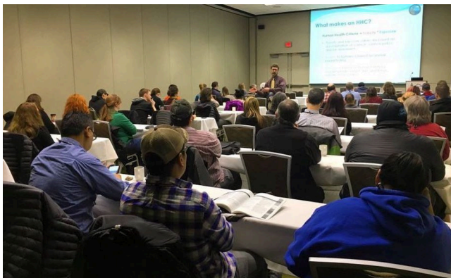
Educational Session at the Alaska Forum on the Environment.

The U.S. Environmental Protection Agency’s (EPA’s) Brownfields and Land Revitalization Program empowers states, Tribal Nations, communities, and other stakeholders to build strong partnerships and local capacity to assess, safely clean up, and sustainably reuse brownfield sites. EPA provides technical and financial assistance for brownfields activities that protect human health and the environment, encourage sustainable reuse, promote partnerships, strengthen local economies, and create jobs.