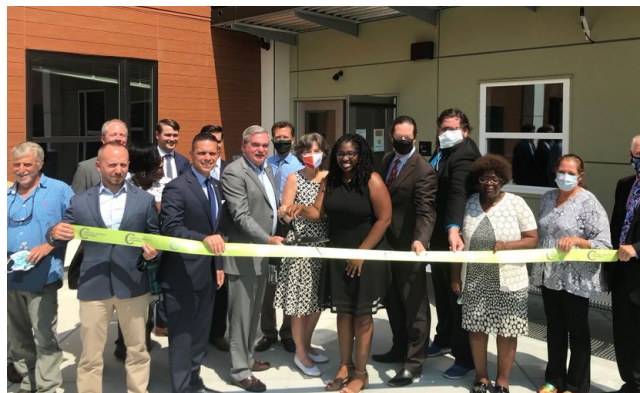
Ribbon cutting ceremony at a new affordable housing apartment building in Schenectady, NY.

Note: these lists are not exhaustive. Please contact your Regional EPA Brownfields office contacts with any questions regarding eligible activities.