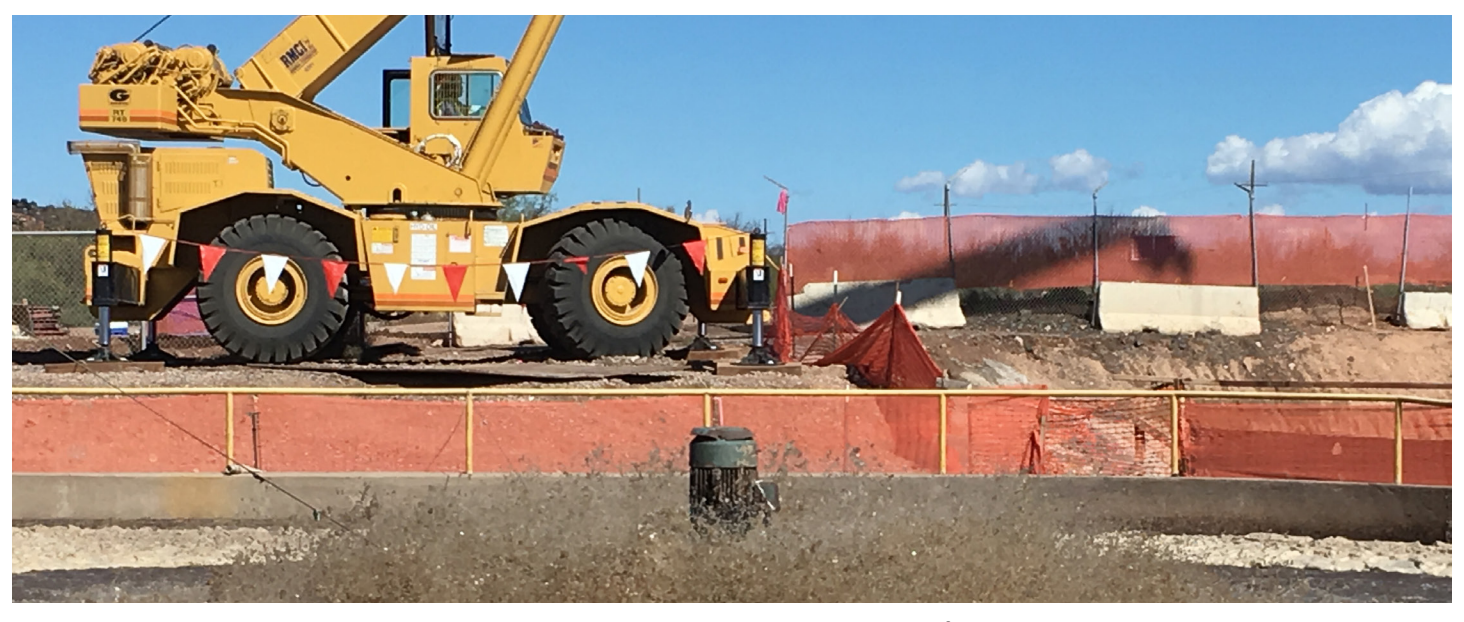
2019 CWSRF Financial Statements | Page 5