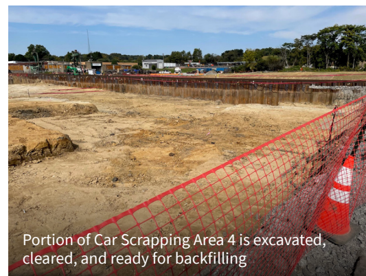
Portion of Car Scrapping Area 4 is excavated, cleared, and ready for backfilling