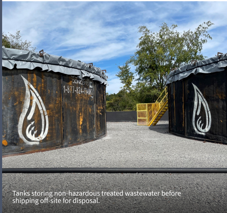
Tanks storing non-hazardous treated wastewater before shipping off-site for disposal.