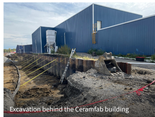
Excavation behind the Cerambfab building

The extent of sediment contamination from the derailment is being evaluated and is expected to lead to additional investigation and cleanup. Details of sediment investigations are described in workplans found here: epa.gov/east-palestine-oh-train-derailment/legal-and-other-documents#wp