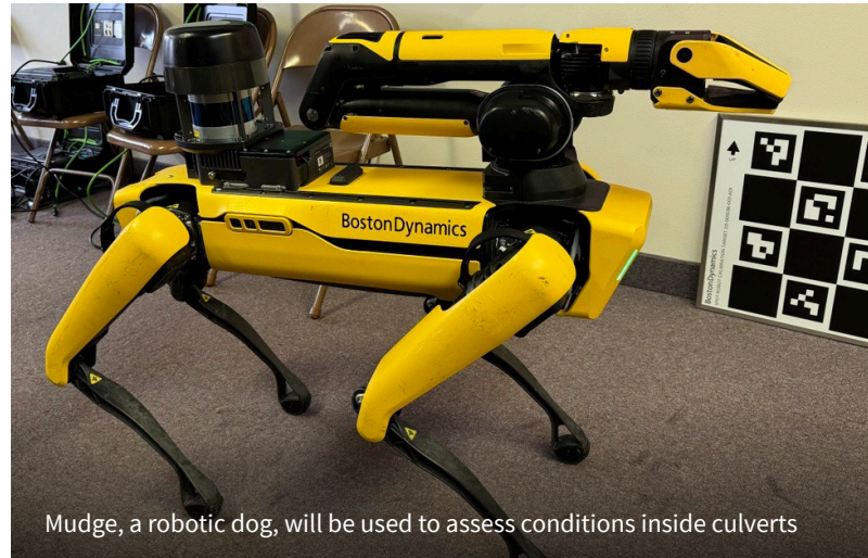
Mudge, a robotic dog, will be used to assess conditions inside culverts