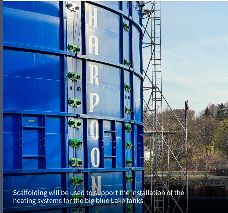
Scaffolding will be used to support the installation of the heating systems for the big blue Lake tanks