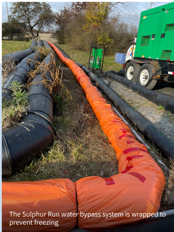
The Sulphur Run water bypass system is wrapped to prevent freezing

As the weather gets colder, winterization is starting at the derailment site to limit freezing and protect workers. The large black Sulphur Run bypass pipes will be winterized to prevent freezing—this may include some repositioning. The big blue Lake tanks, and the other tanks containing treated non-hazardous liquid, are being outfitted with heating systems. Some water vapor may be visible due to the temperature difference, but it poses no health risks. These efforts will not hinder water quality monitoring, and regular system testing will continue. Also, you may notice a crane which will be used to install a large tent to cover the temporary wastewater treatment plant and provide an indoor area for workers.