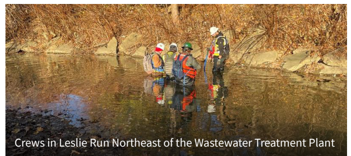
Crews in Leslie Run Northeast of the Wastewater Treatment Plant