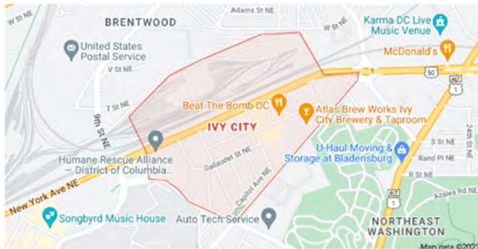
Figure 1: Ivy City Washington, DC map

On May 5, 2022, the District of Columbia (DC) Department of Energy & Environment (DOEE) sponsored a walk in the Ivy City community (historically black community in northeast Washington, DC). It was then that the community identified odor concerns to EPA and raised possible environmental issues from a facility in the neighborhood, National Engineering Products (NEP). The neighborhood also has several industries in the surrounding area that could contribute to odors and emissions in the community. As a result, DOEE conducted a short-term