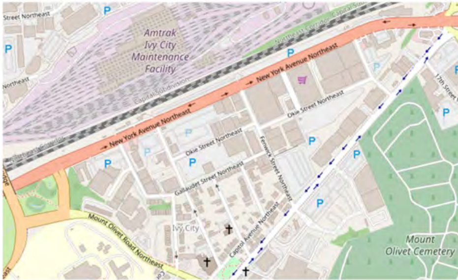
Figure 2: Ivy City Washington, DC close-up map

The second round of EPA sampling consisted of non-residential areas (completed August 31 – September 2, 2023). The third round of EPA sampling consisted of residential areas (completed December 2023). The fourth round of EPA sampling consisted of non-residential areas (completed January 2024). The air monitoring plan, consisted of sampling during the production day, a non-production day, a weekend day, and background sampling on all 3-days (with no sources present located in Beltsville, MD). By doing a more comprehensive sampling, we hope to see if there would be a difference in ambient air and to see if there are other sources of emissions contributing to community exposure. The first, second, third